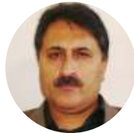
Commissioner & Secretary Higher Education J&K