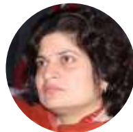
Director School Education Jammu