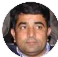
Dy. Director AICTE