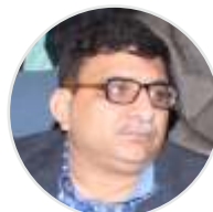
Asst. Director AICTE