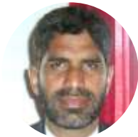
Nodel Officer Srinagar