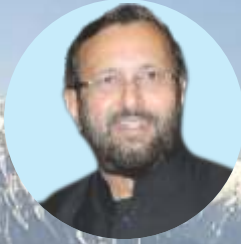
Hon'ble Minister of HRD Govt. of India