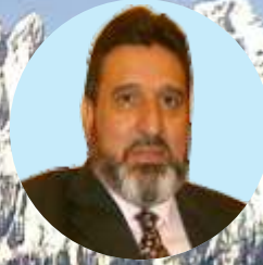
Hon'ble Minister of Education Govt. of J&K