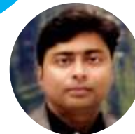
Director School Education Kashmir