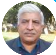
Nodel Officer Jammu

Representatives of Government of Jammu & Kashmir, Nursing Council of India and University Grants Commission Facilitating Students Under Prime Ministers Special Scholarship Scheme