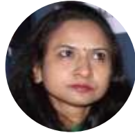
Nursing Council Representative