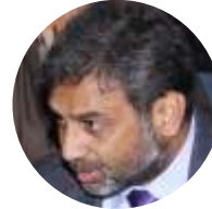
Principal Secretary School Education J&K